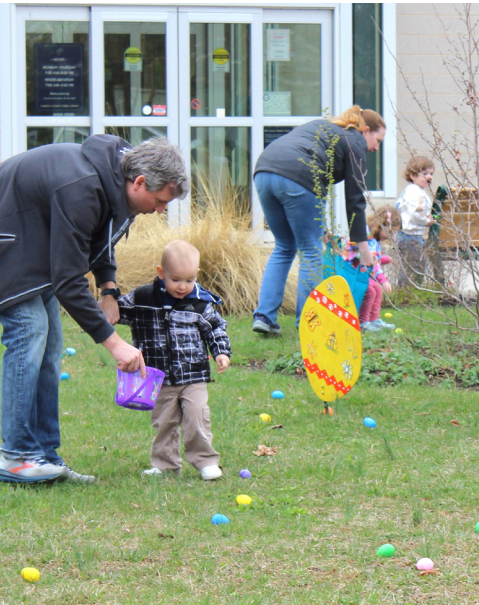
Above: Annual Easter Egg Hunt held in partnership with the Roaring Run Lions Club at Finksburg Branch.